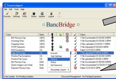
TreasuryAgent at client office

websites or problematic and expensive FTP services. BancBridge TreasuryAgent makes it easy to automatically exchange data and transactions between inexpensive bank web-based cash management system and corporate client systems, with no modifications or technical assistance. Just like the old ProComm Plus or CrossTalk-type technology, BancBridge TreasuryAgent "dials" up the bank website and does the banking automatically!